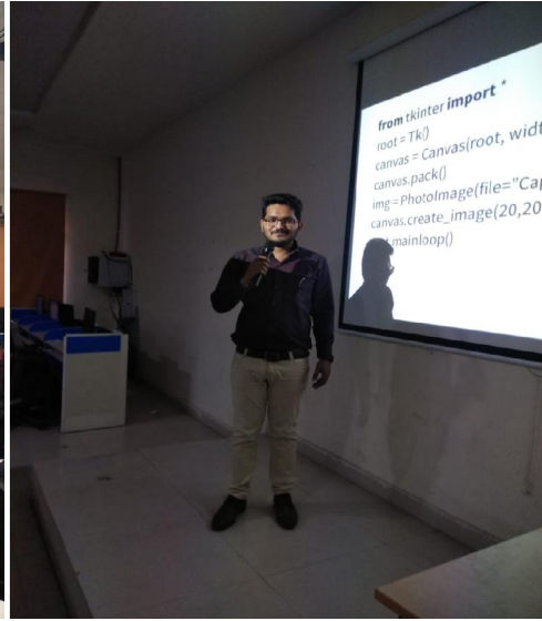
Students executing the programs